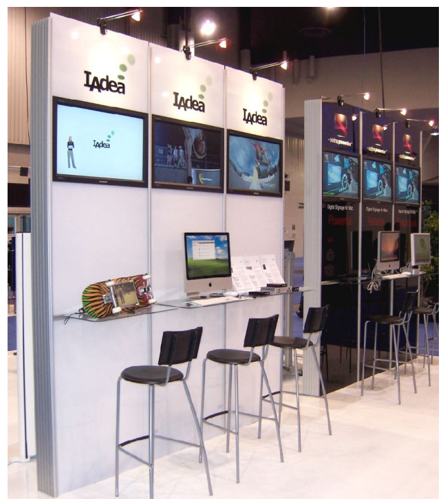
Customised Media Wall for Exhibition Stands