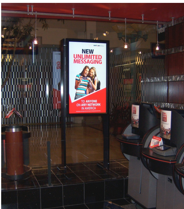
Customised Media Wall for Retail

A Media Wall has 3 leg heights - 2.0m, 2.2m, 2.4m. The legs have optional 4" cable trays, allowing the client to specify how many vertical trays are required. To keep the cost of the legs down, we have optional end covers. These will only be required if the legs are in view. And finally, the Media Wall has optional bolt down bases instead of feet. The Media Wall has customer definable beam lengths up to 3.2m between legs and a choice of sizes of beam - 60, 120 and 180mm deep. Each beam has a 3" cable tray as standard, with options of 2" and 4" available if required. Optional under slung cable tray brackets bring Monitor Stack versatility to the Media Wall range.