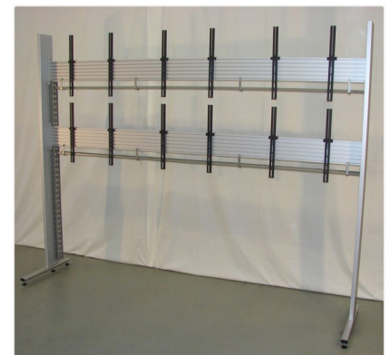
3 x 2 x 42" screen arrangement and support frame

Bolt-down Bases or Feet are available. Bolt-down bases are particularly useful where the Feet may intrude into a walkway or interfere with desk layouts.